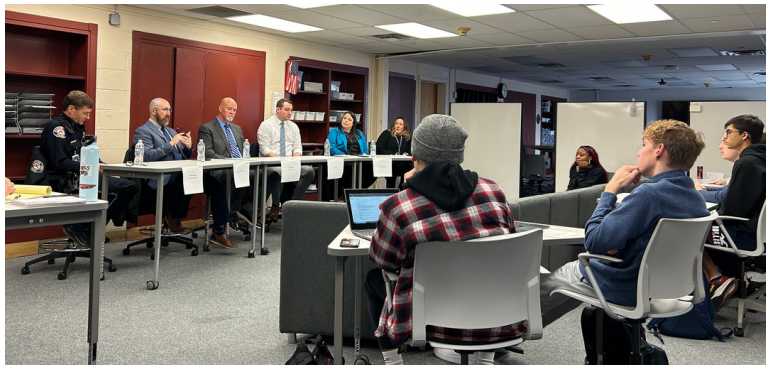
Civics legal professional panel. Students heard from a district judge, prosecutor, victim liason, parole officer, sheriff deputy, and police officer.

Here are some highlights of what students were involved in during the first semester of Venture: