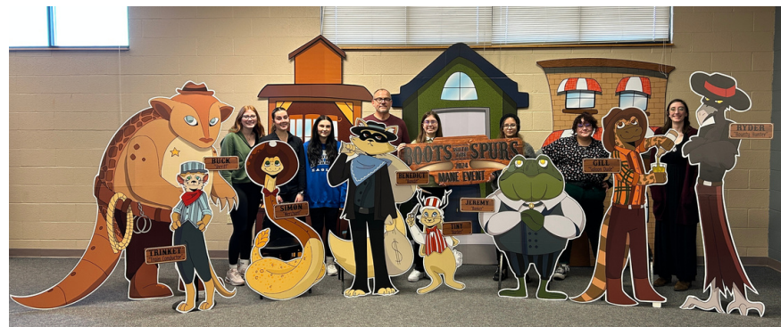
Digital Design students create characters/theme for Mane Event. "Boots with the Spurs"