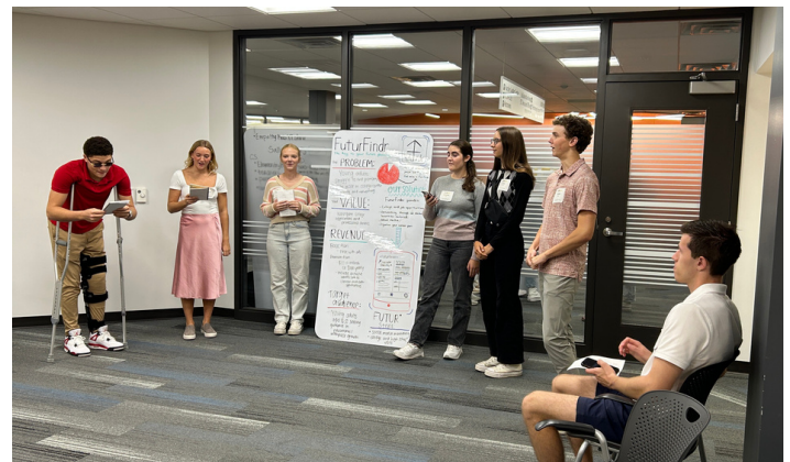
Venture Marketing students participated in Design Dash at the University of Iowa- a day long entrepreneurshhip challenge to create and and market a product to a panel of business mentors.