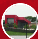
Linn-Mar High School