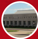
Echo Hill Elementary