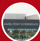
Hazel Point Intermediate