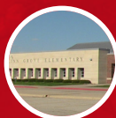
Linn Grove Elementary