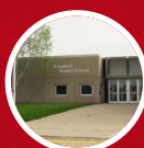
Excelsior Middle School