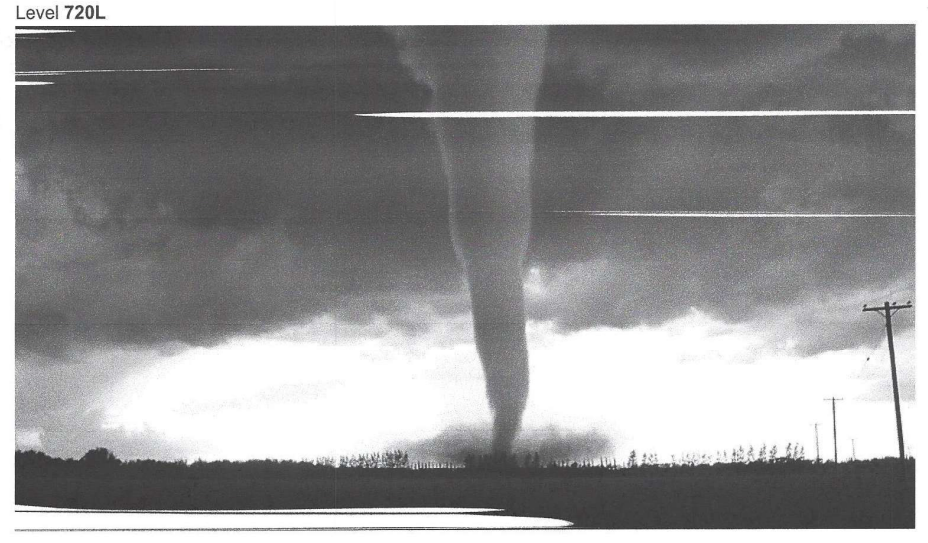
TOP: A category F5 tornado, upgraded from initial estimate of F4, viewed from the southeast as it approached Elie, Manitoba, on June 22, 2007. Photo by: Justin Hobson via Wikimedia. BELOW: This map explains why tornadoes so frequently occur in the area of the United States known as Tornado Alley, Image from: Wikimedia.

By National Oceanic and Atmospheric Administration, adapted by Newsela staff on 02.10.17 Word Count 728