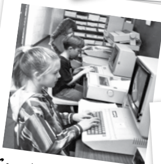
Computer class in 1993.