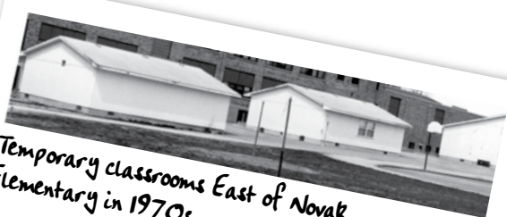
Temporary classrooms East of Novak Elementary in 1970s.