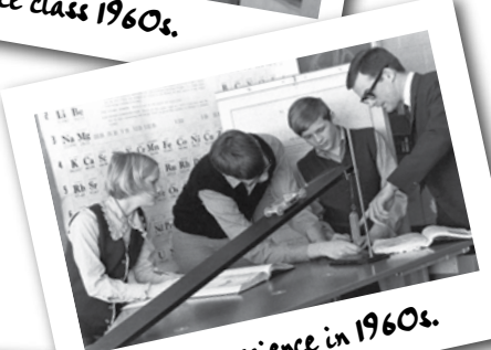
High school science in 1960s.