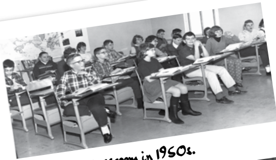
Junior high classroom in 1950s.