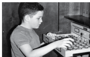
Choosing a film strip in 1970s.