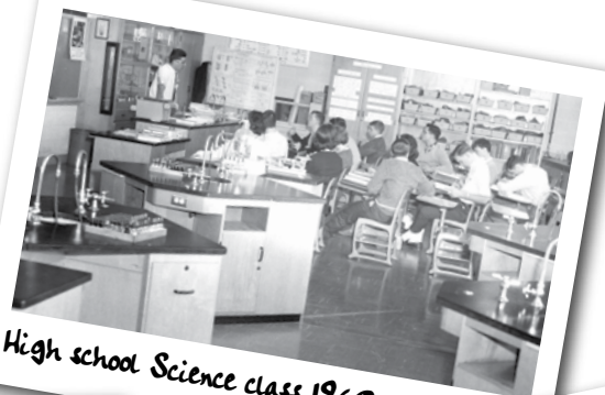
High school Science class 1960s.