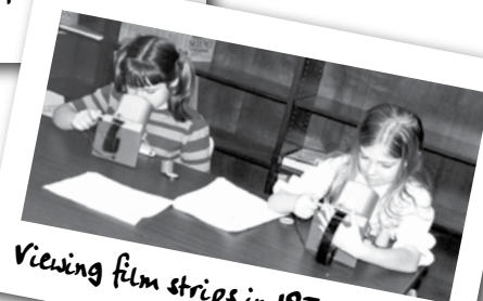
Viewing film strips in 1970s.