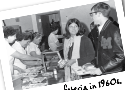
High school cafeteria in 1960s.