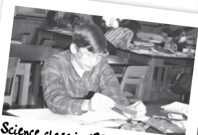
Science class in 1970s.