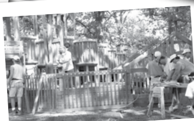
Indian Creek playground construction in 1995.