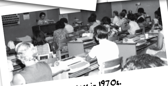
High school typing class in 1970s.