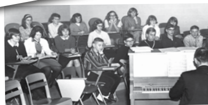
High school music class in 1960s.