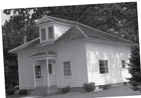
A one room school house called Hazel Ridge or 'the White House' housed many departments of the district including Building, Grounds Transportation and The Educational Services Center (ESC) until 1975