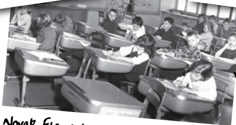
Novak Elementary classroom in 1956.