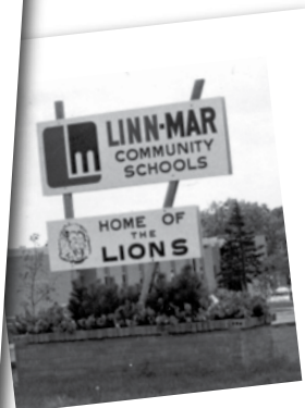
Signage by the high school in 1963.