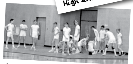
High school Gym class 1960s, current Media Center.

* Dates on photos are approximate. If you have additional historical information please contact Information Services at (319) 447-3005.