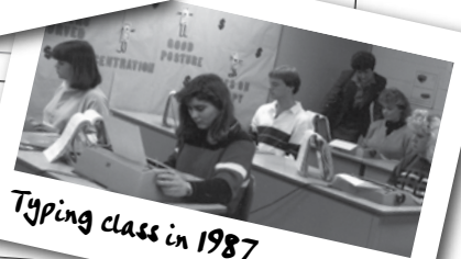
Typing class in 1987.