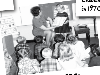
Elementary classroom 1970s.