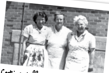
Cooking staff at Marion Rural Independent circa 1950.