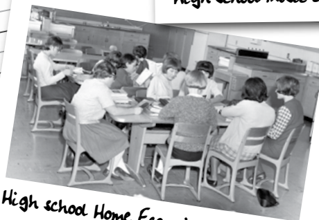
High school Home Economics class 1960s.