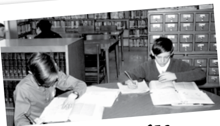
Studying at the library in 1970s.