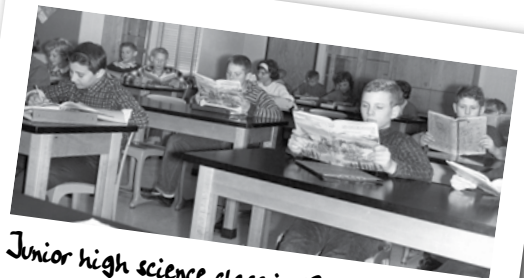
Junior high science class in 1950s.